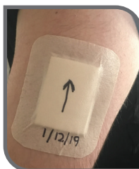
Figure 1: Remove dressing in direction of arrow 5 to 7 days after application or if 75% strikethrough