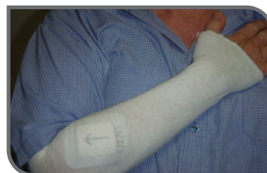
Figure 2: Limb protector to prevent further trauma