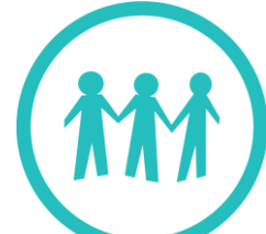
establishing community links