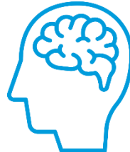
getting treatment for health issues