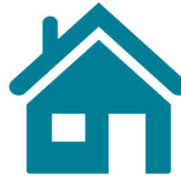
Finding Secure Housing

Court Link connects you to care and support services that provide housing, employment, management of drug and alcohol dependence, health and other social needs.