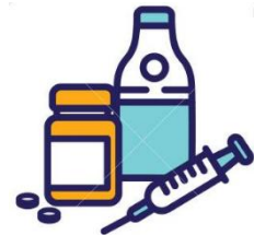
addressing problematic substance use